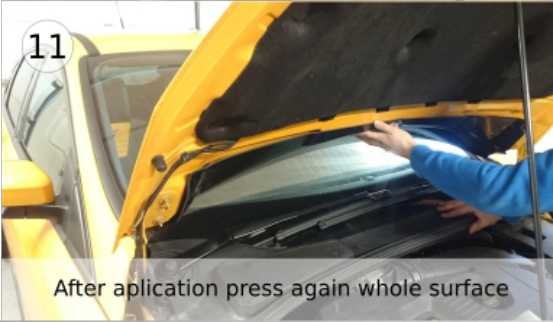
11 After application press again whole surface