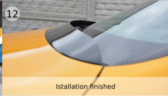
12 Installation finished