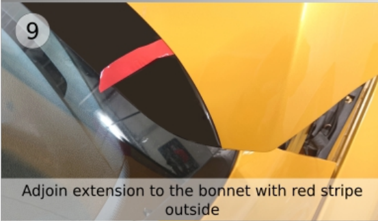
9 Adjoin extension to the bonnet with red stripe outside